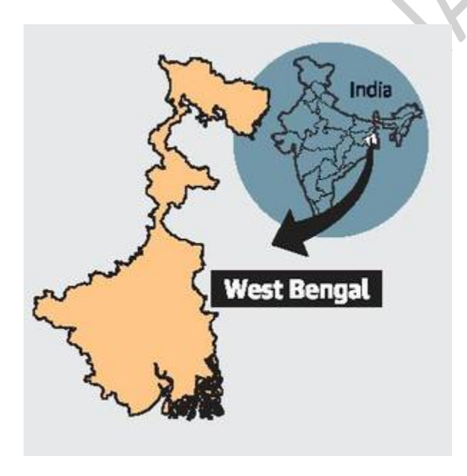
What is the problem?

It's a land-starved State, and between 1990 and 2016, West Bengal lost more to erosion. A report by the National Centre for Coastal Research (NCCR), under the Ministry of Earth Sciences, released recently said West Bengal recorded the maximum erosion of 63%, followed by Puducherry 57%, Kerala 45%, and Tamil Nadu 41%.